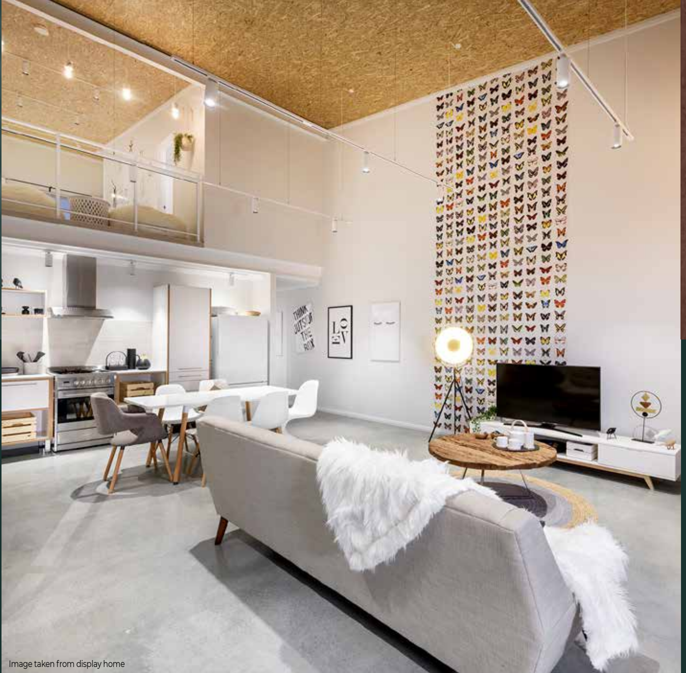
Image taken from display home