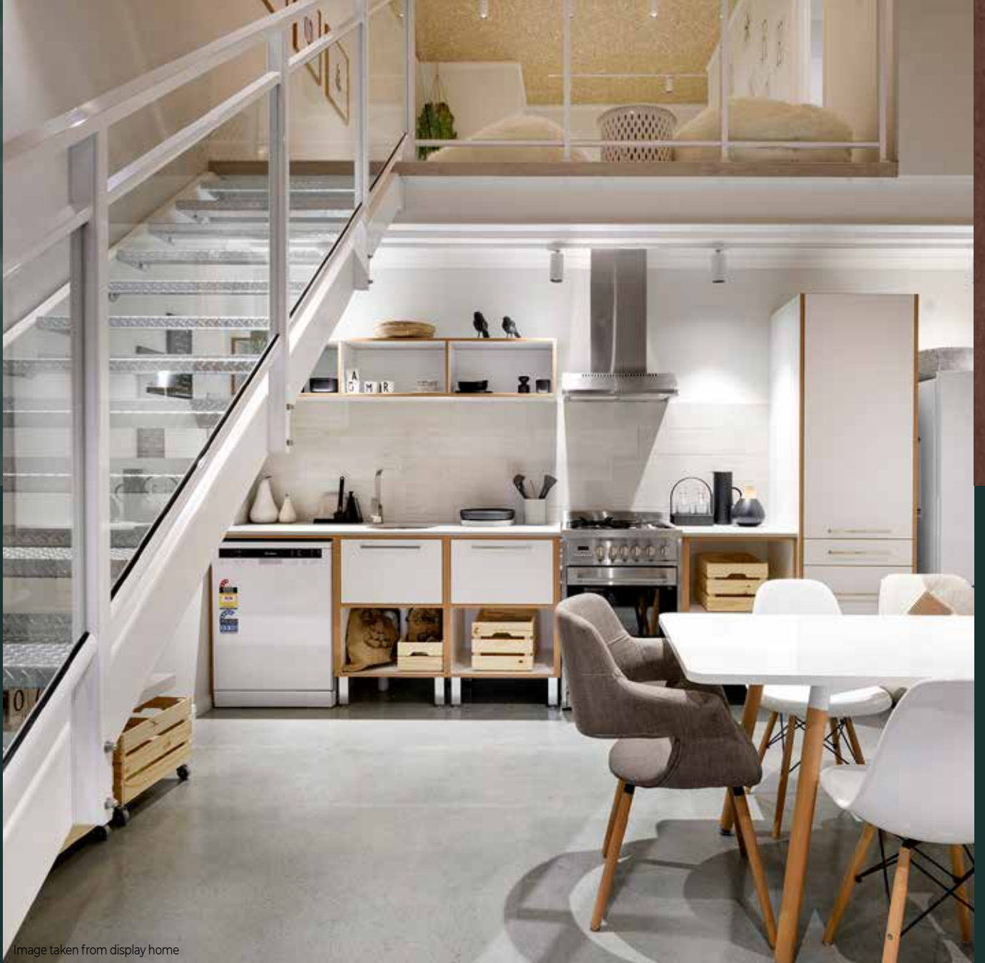
Image taken from display home