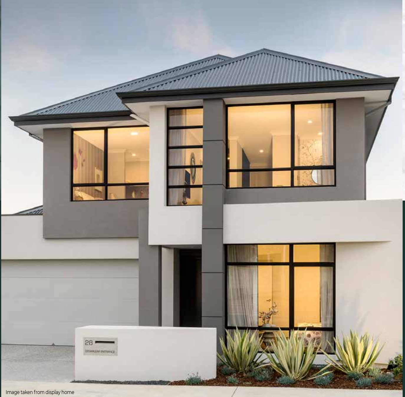
Image taken from display home