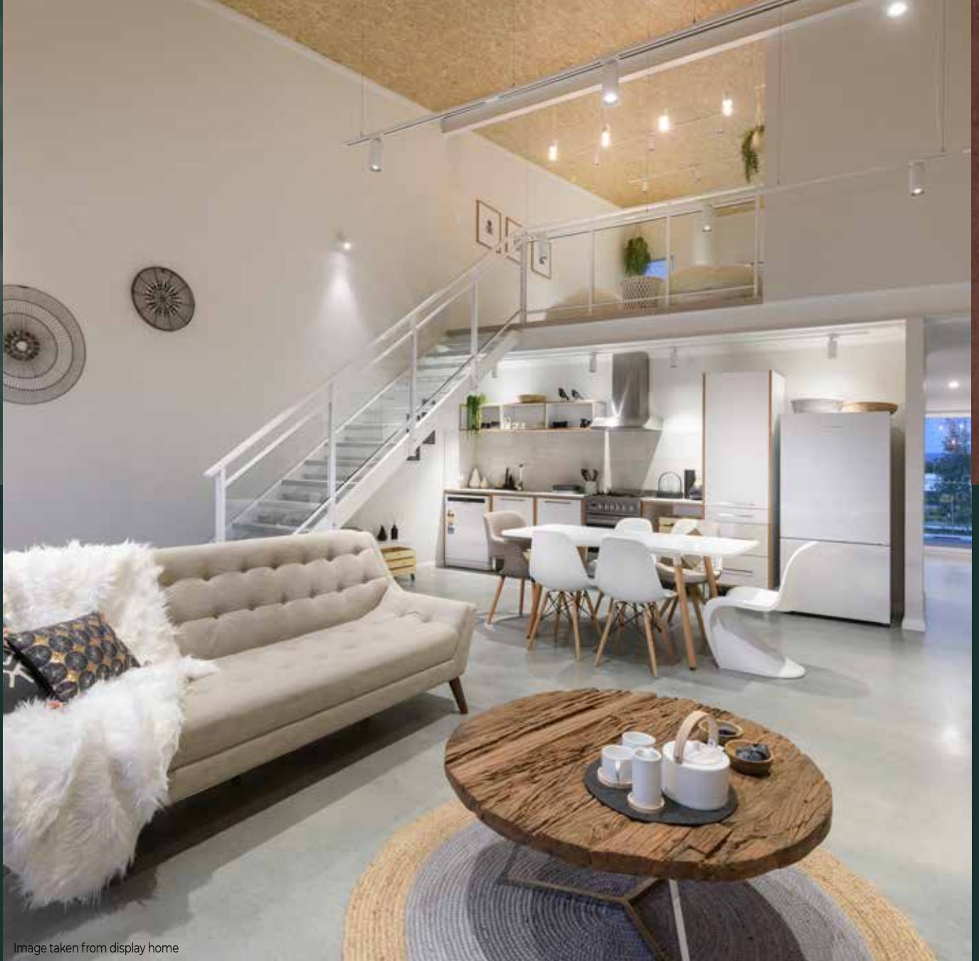
Image taken from display home