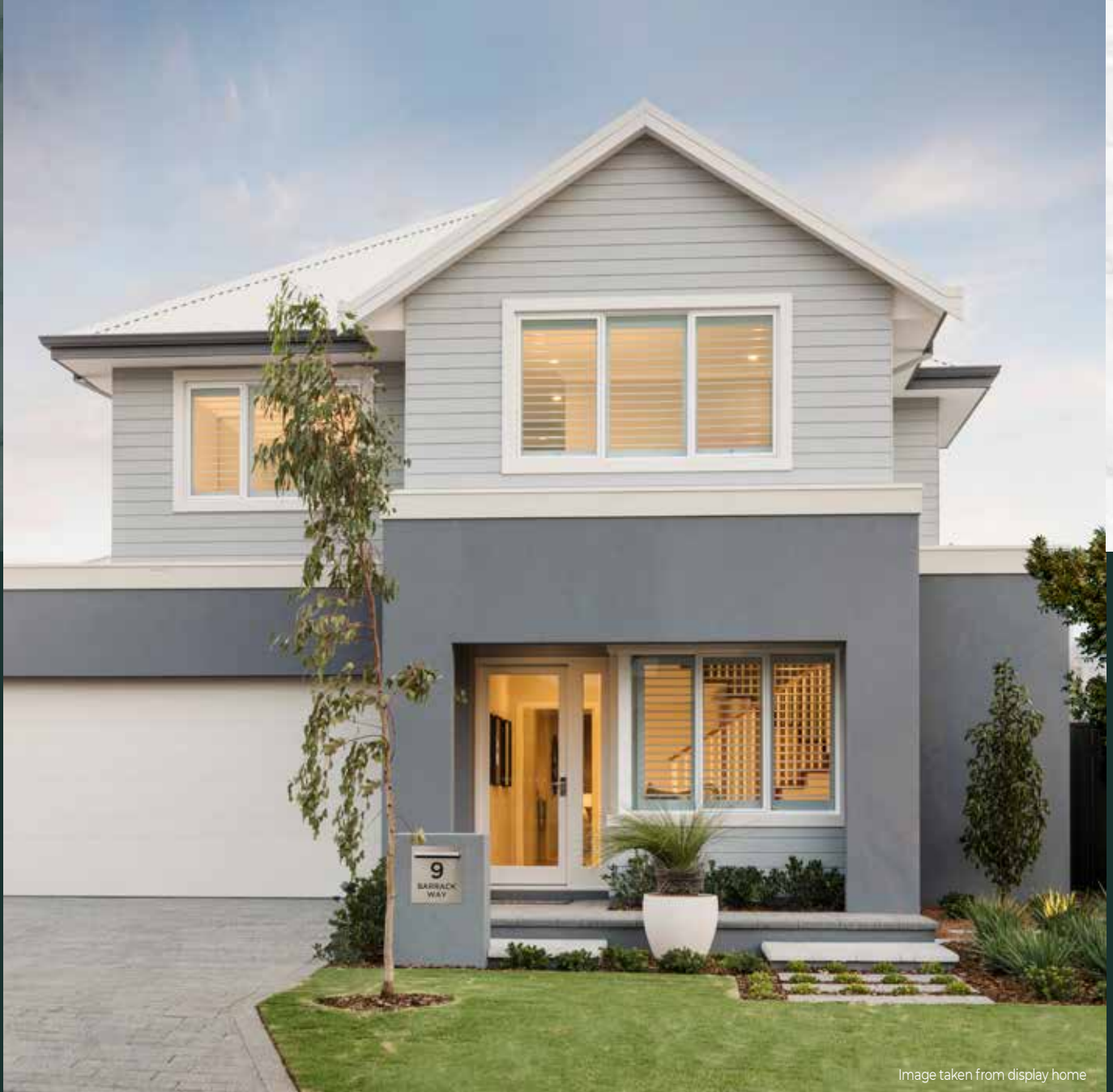
Image taken from display home