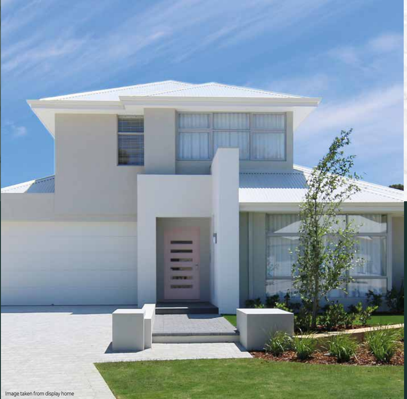
Image taken from display home