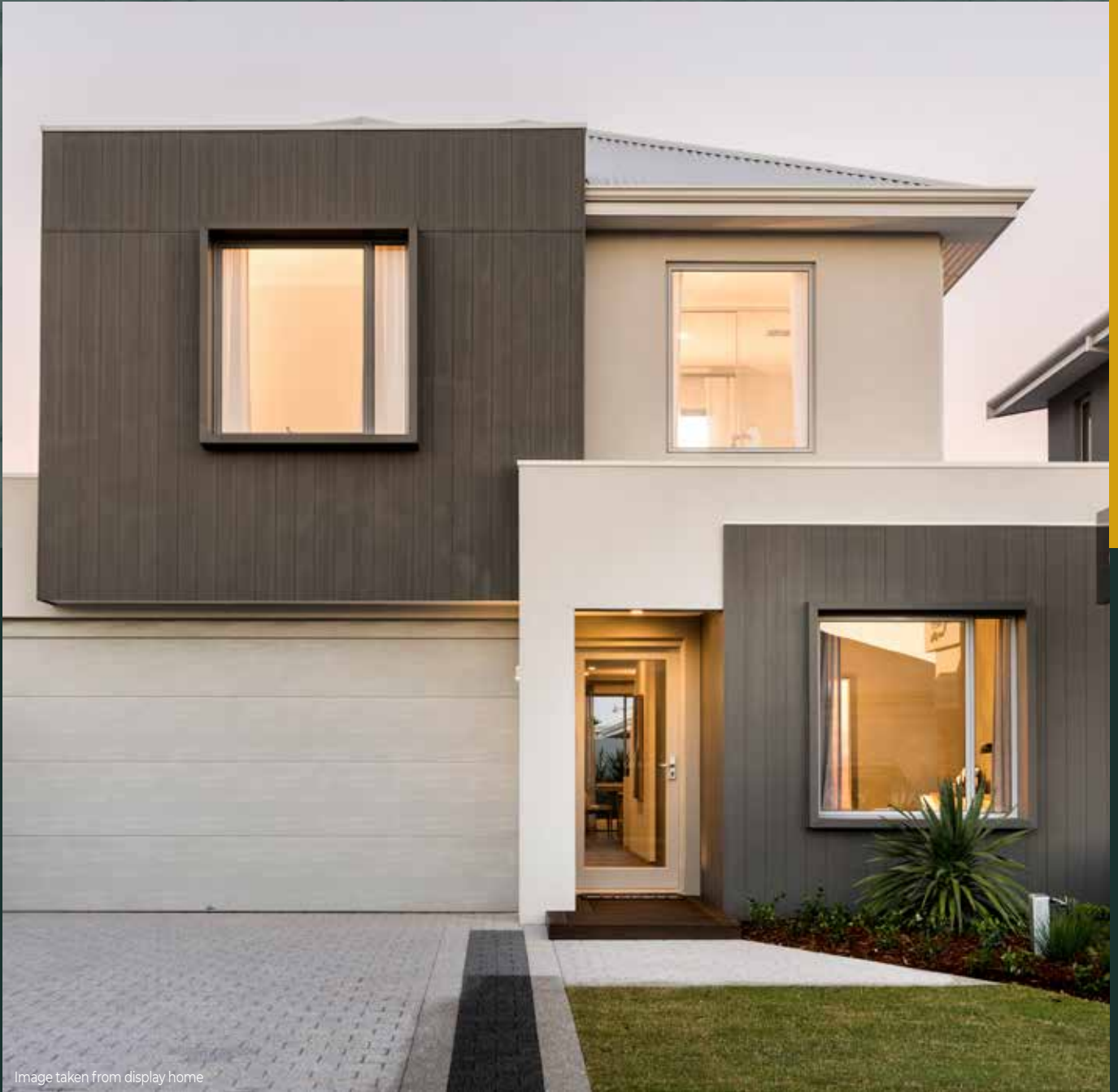
Image taken from display home